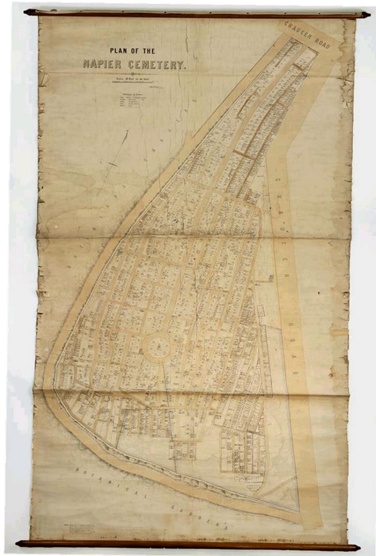
Image Ref: Plan, Napier Cemetery, 1884, Alfred Jarman (b.1835, d.1916), gifted by Napier City Council, collection of Hawke's Bay Museums Trust, Ruawhoro Tā-ū-rangi, 2020/9