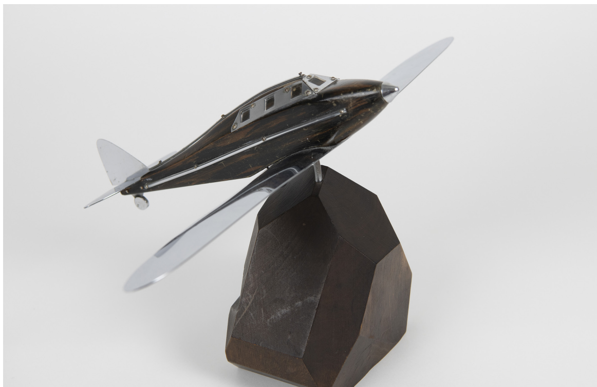
Image: Art Deco aviation desk model airplane and stand , circa 1940, purchase, collection of Hawke's Bay Museums Trust, Ruawhāro Tā-ū-rangi, 2022/4/2. All rights reserved. The rights owner for this work has not been able to be identified.

Conservation Reserve Fund - Funds which the Trustees have identified and set aside for applying to the cost of conservation of collection items.