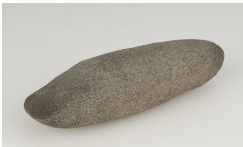
Image: Toki , Hawke's Bay, gifted by Don Millar, collection of Hawke's Bay Museums Trust, Ruawharo Tā-ū-rangi, 2021/8/5. Public Domain.

There were no significant events after balance date (2021 nil).