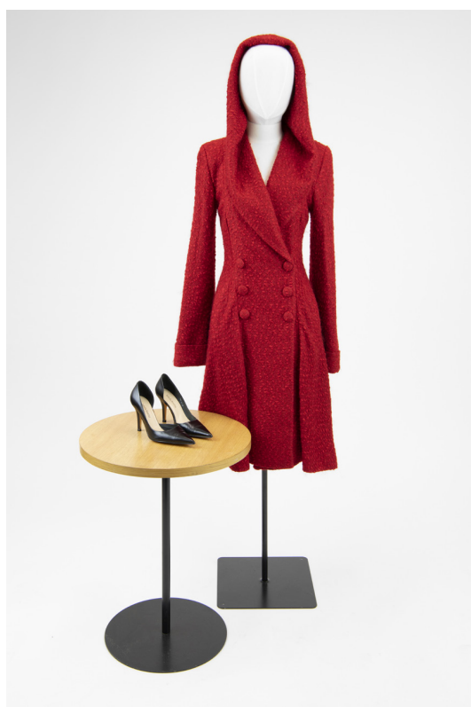
Image: Hooded dress and shoes , 2000s, Minh Ta, gifted by Minh Ta, reproduced by kind permission of Minh Ta, collection of Hawke's Bay Museums Trust, Ruawhāro Tā-ū-rangi, 2021/24/4. All rights reserved.