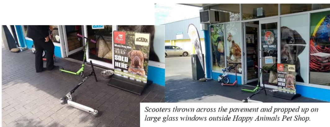
Scooters thrown across the pavement and propped up on large glass windows outside Happy Animals Pet Shop.

The TMA understands that design of town centres is important but fails to reconcile how design considerations trump safety concerns?