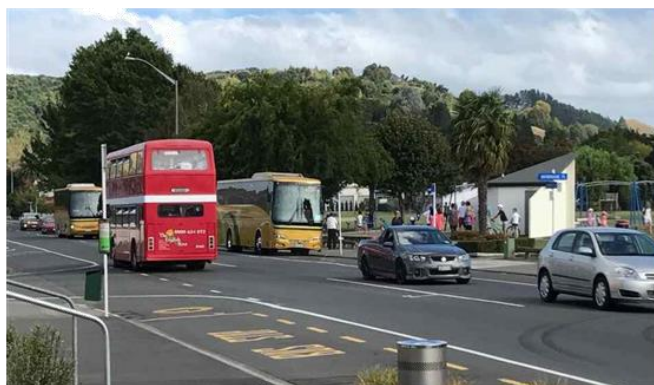
Two Busses parked up with Cruise ship passengers waiting to use the Taradale Park toilets, with another passing by – a common occurrence during the Cruise Ship season.

We understand since then that a consultation regarding future use of Taradale Park is in the pipeline. However, unless there is a possibility of the toilet block being moved or significantly re-modelled, there is no reason why the application of a Mural could not be undertaken now.