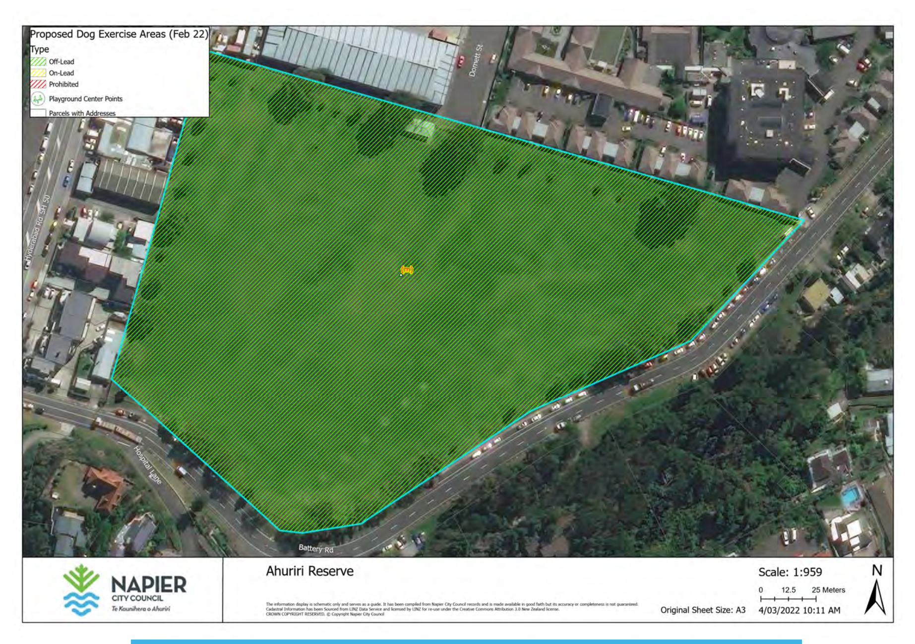
Map 4: Ahuriri Reserve Dog Exercise Area (Second Schedule (m))