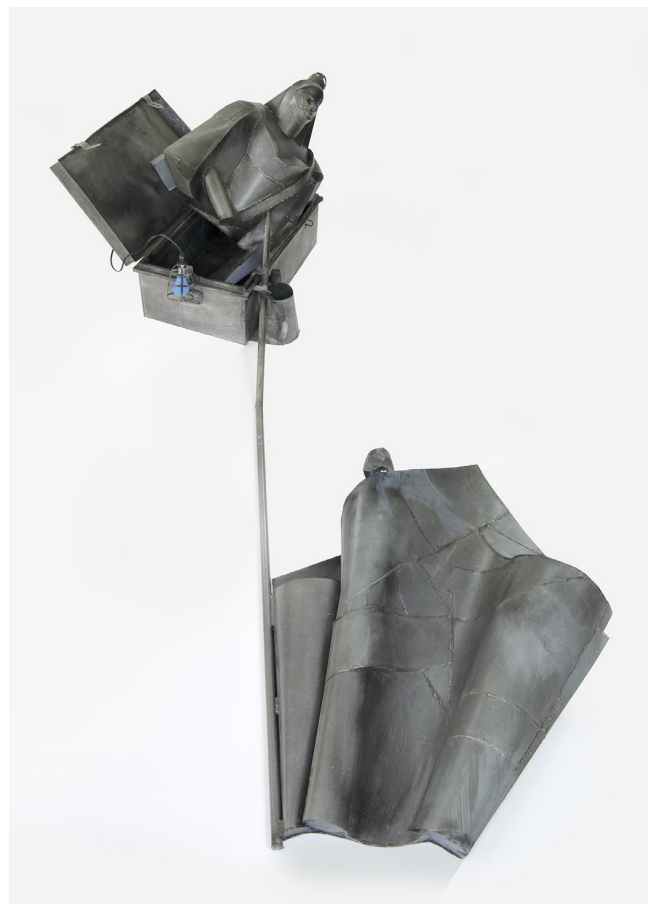
Image Ref: Hobson's Baggage , 1995, Greer Twiss (b.1937), gifted by Greer Twiss. Copyright courtesy of Greer Twiss, collection of Hawke's Bay Museums Trust, Ruawhara Tā-ū-rangi, 2020/32