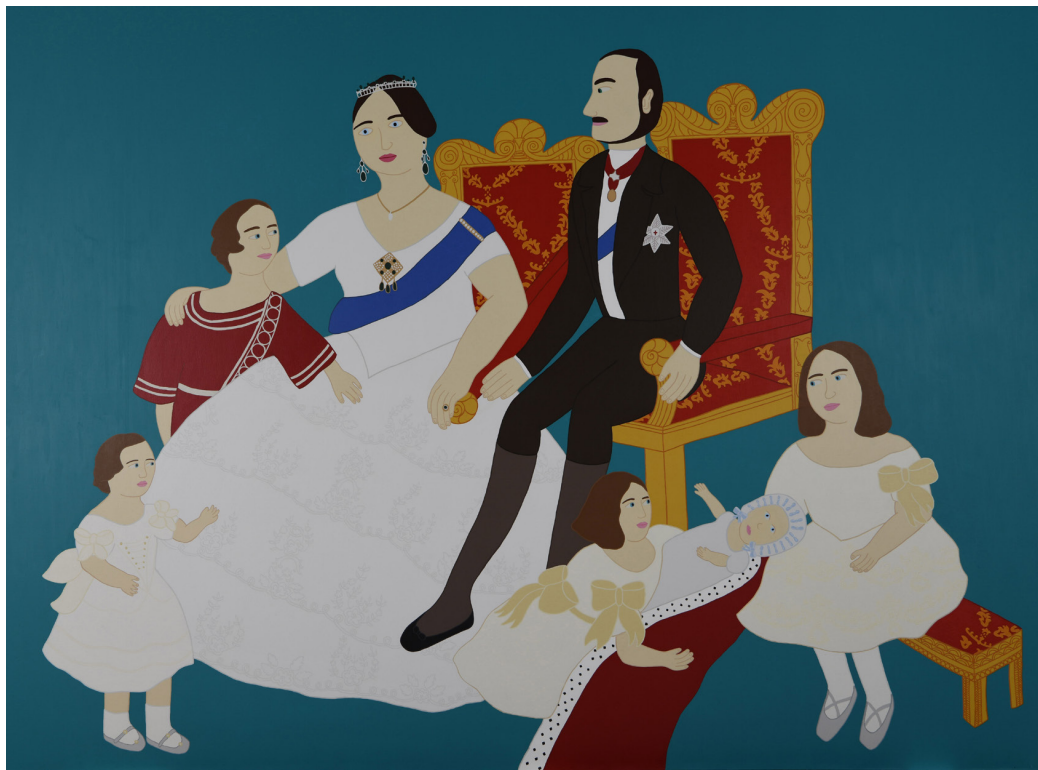
Image Ref: The Harvest, 2020 , Ayesha Green (b.1987), gifted by the MTG Foundation, collection of Hawke's Bay Museums Trust, Ruawharo Tā-ū-rangi, 2020/40

The Trust recognises and appreciates the ongoing Collection acquisition support that it receives from the Hawke's Bay Museums Foundation and many private benefactors.