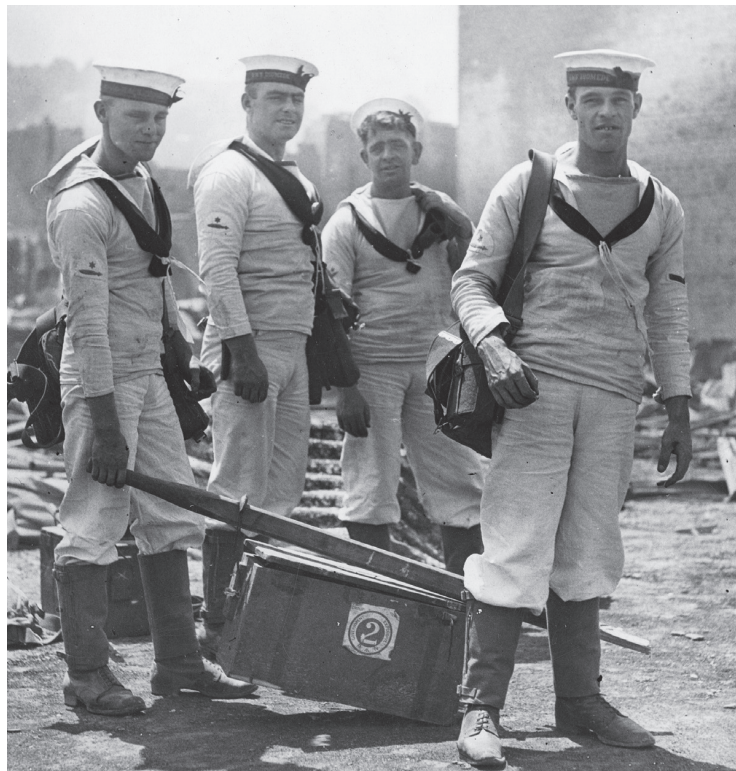
Image Ref: Naval blasting party at Napier, Evening Post Print (estab. 1865, closed 2002) , purchase, collection of Hawke's Bay Museums Trust, Ruawhoro Tā-ū-rangi, 2020/30/1