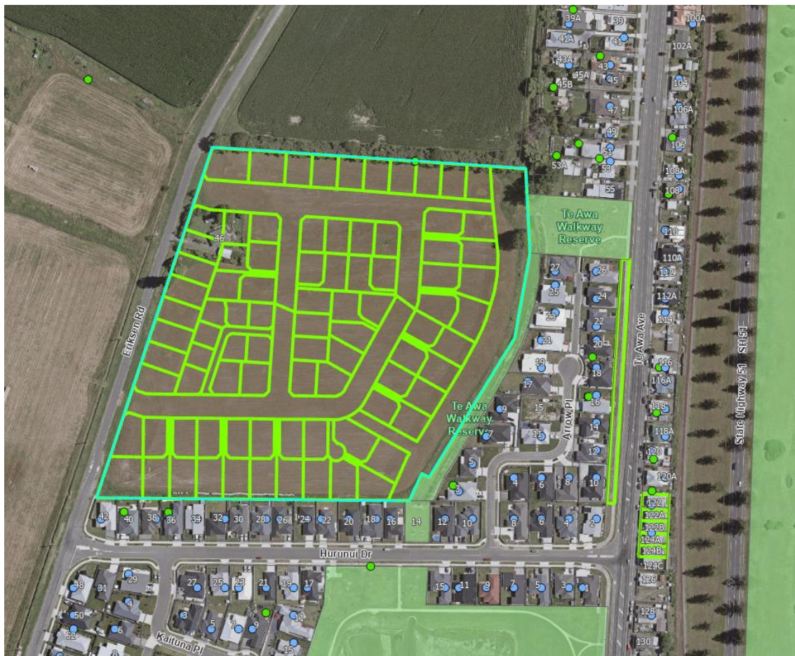
Figure 1 – Subject Site, showing proposed layout

The site is located at 46 Eriksen Road near where it joins Hurunui Drive, see Figure 1 below.